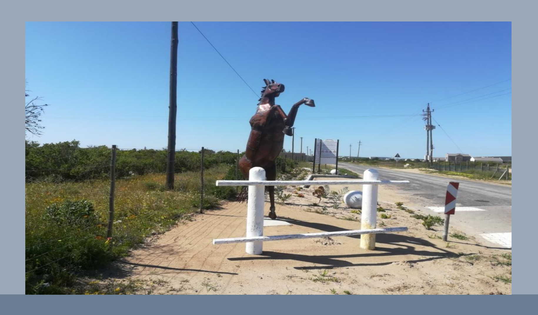
BEAUTIFICATION AND RESURFACING OF STRAND ROAD